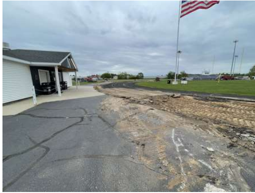
HS Track Demolition