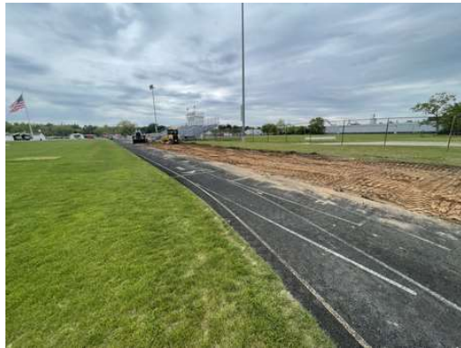
HS track Demolition