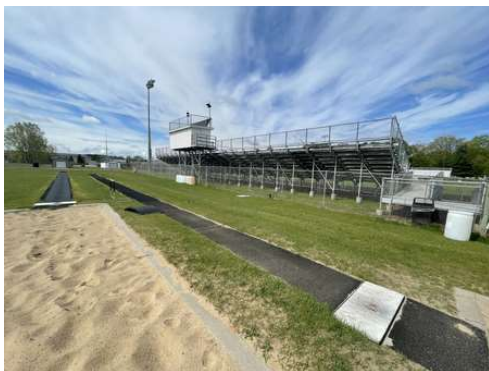
Old Long Jump