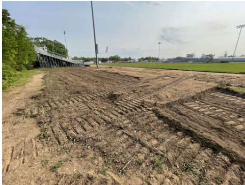
Tree / Bush Removal