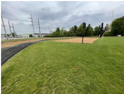
South End of Track