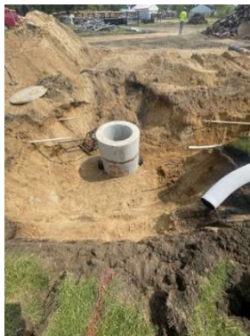
Installing Structure for Track Underdrain