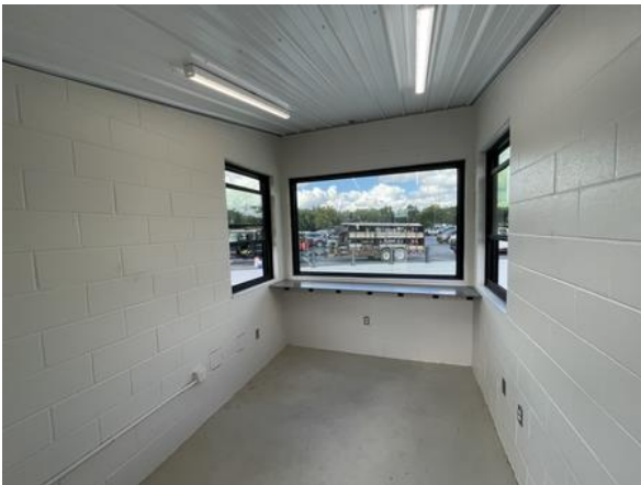
Inside of Ticket Booth