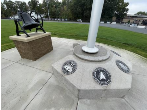
Monument Plaques and Victory Bell