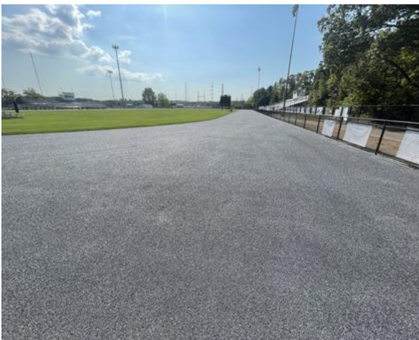
Final Coat of Grey on Track