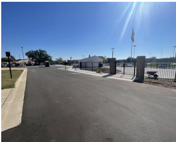
Player Entrance Piers