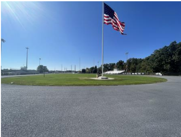
Sod Complete and Victory Bell Installed