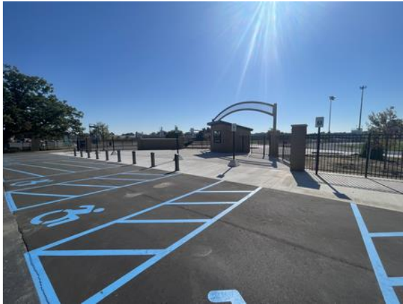
Main Stadium Entrance